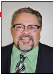
Martin Dempsey Midwest