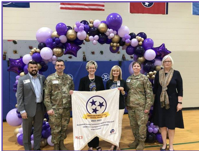
Robert E Lee Elementary School PSSA Award Ceremony