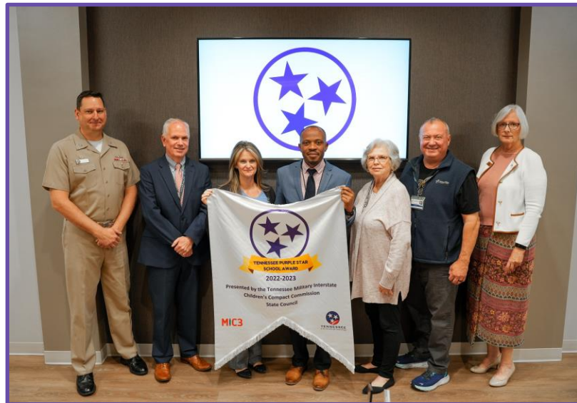
Arlington Community Schools PSSA Award Ceremony