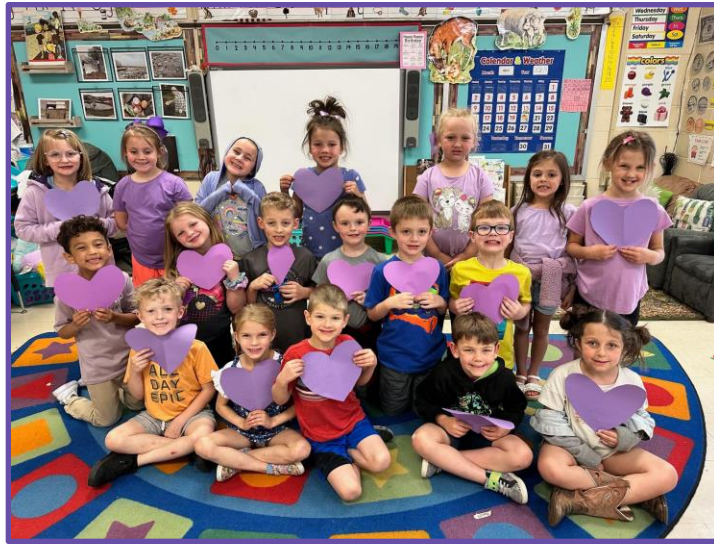
Ellen Myers Primary School MOMC Purple Up Day