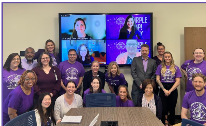
Steven A. Cohen Military Family Clinic, Clarksville, Tennessee