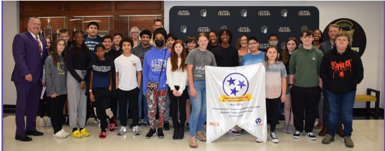
Millington Central High School PSSA Award Ceremony

Carpenters Middle School in Blount County received Tennessee Purple Star School Award