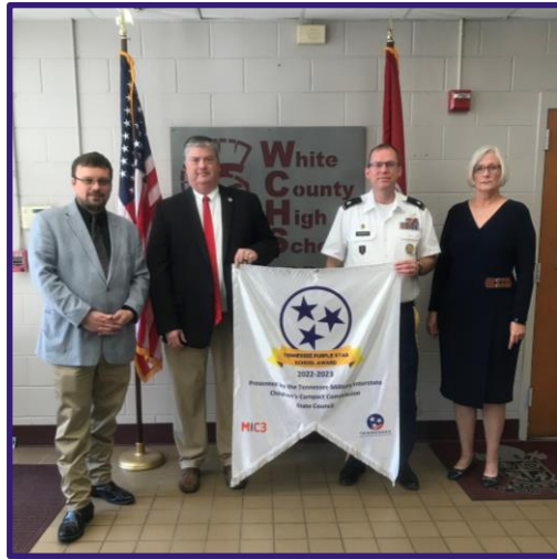
White County High School Schools PSSA Award Ceremony