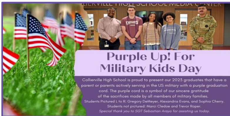
Collierville High School MOMC Purple Up Day