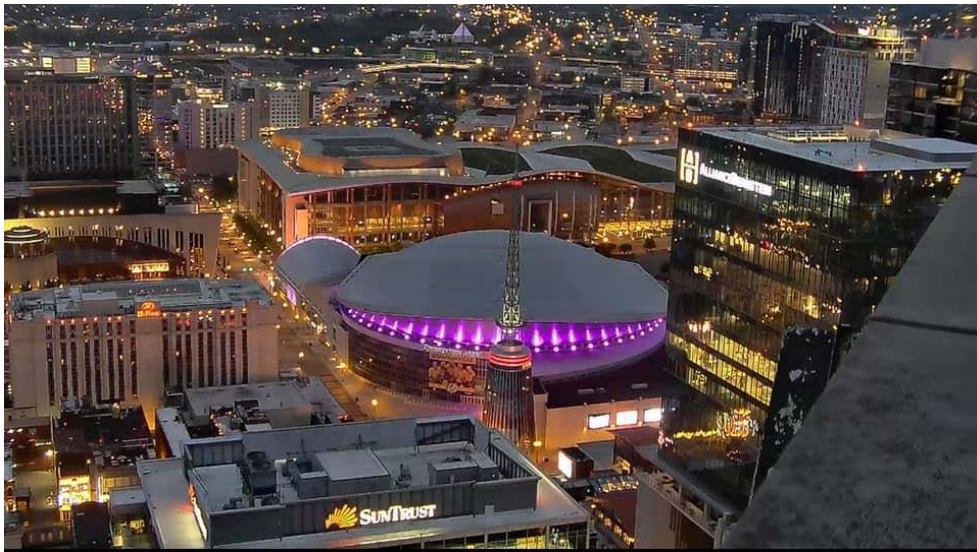
Bridgestone Arena, Nashville, Tennessee goes Purple on April 21, 2021, for MIC3 National Purple Up Day!