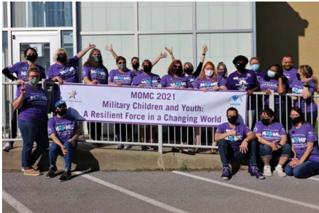
Fort Campbell MWR