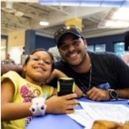
Service and Family Members